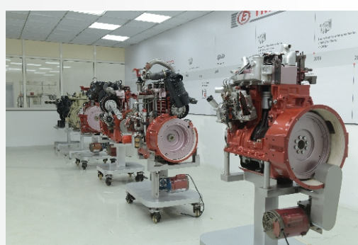
Eicher Engines are Manufactured and Marketed by TAFE Motors and Tractors Limited, under a license from Eicher Goodearth Private Limited. "EICHER" is the exclusive trademark of Eicher Goodearth Private Limited.