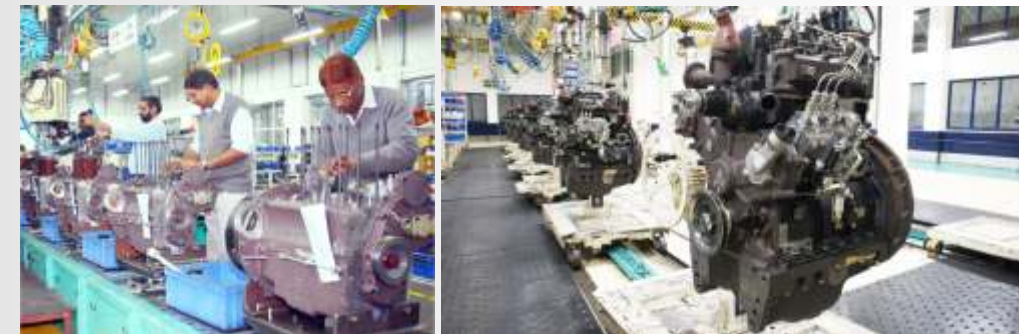
Eicher Engines are Manufactured and Marketed by TAFE Motors and Tractors Limited, under a license from Eicher Goodearth Private Limited. "EICHER" is the exclusive trademark of Eicher Goodearth Private Limited.

TMTL Engines Division is one of the fastest growing engines manufacturers in India. Backed by a strong, vast and ever-expanding service network it enjoys a dominant market share in the Telecom segment where timely and quality service is a critical factor. TMTL Engines Division's flagship product, 125 kVA genset, is one of the most technologically advanced gensets in India with indigenously developed CRDI engine and Isochronous Governing, which is helping TMTL carve a unique identity for itself in its quest to truly become #IndiaKaEngine.